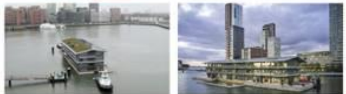
Largest floating office: Global Centre on Adaptation